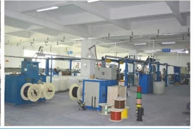
Professional instrument detection,