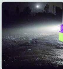
lighting for write lighting