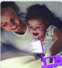
It is a emergency spare

Only one cup of water , 5g salt , Can be used in any room temperature environment, And as long as the salt, whether it is wine or urine, Can be bright with water source