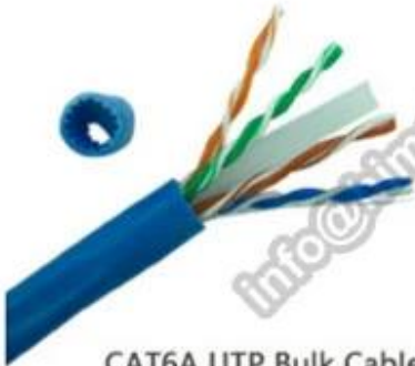
CAT6A UTP Bulk Cable