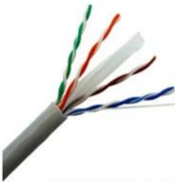
CAT6 UTP Bulk Cable