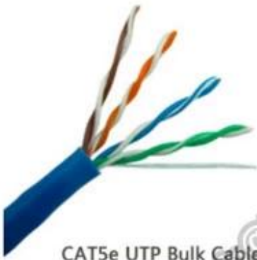
CAT5e UTP Bulk Cable