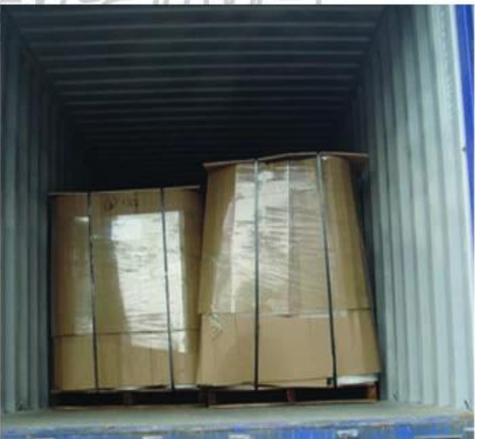
4. [Placeholder for a detailed caption or description of the images.]