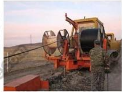
✓ Direct bury