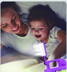
It is a emergency spare

Only one cup of water , 5g salt , Can be used in any room temperature environment, And as long as the salt, whether it is wine or urine, Can be bright with water source