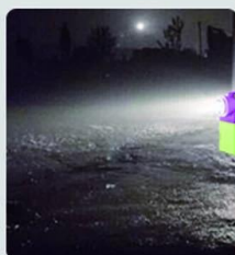
lighting for write lighting