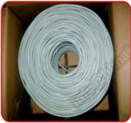
305m/pull out box