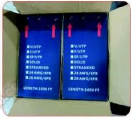
2boxes in carton