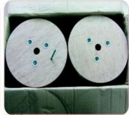
305m wooden reel in carton