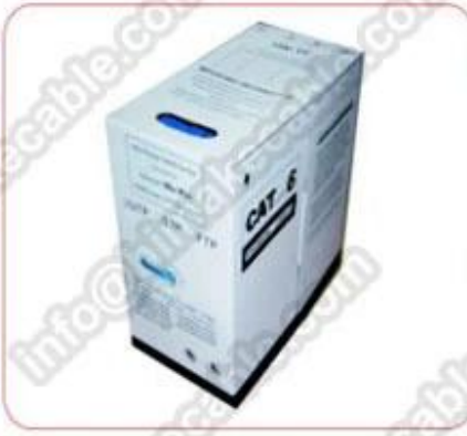
colour pull out box